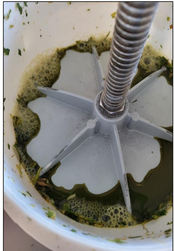
Figure 1. Leachate production from a male-sterile sorghum hybrid harvested with a 6 mm theoretical length of cut and 2 mm kernel processing roll gap with 77% moisture content after compression with a manual press.

The previous article discussed strategies to decrease forage moisture content at harvest and ensiling. However, harvesting methods – such as the theoretical length of cut (TLC), use of kernel processors and roll-gap settings; packing density; and silo configurations also may affect leachate production 5 (Fig. 1). This second article will discuss harvesting methods to decrease the risk of leachate production.